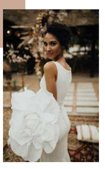
Flowers / Greenery: